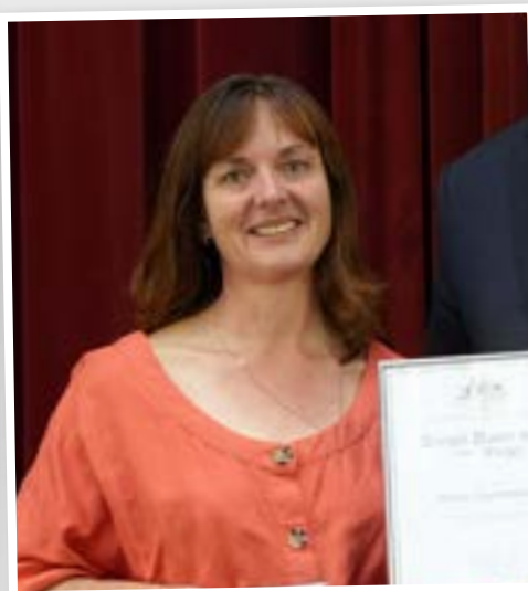
Small Business of the Year Amain Gymnastics